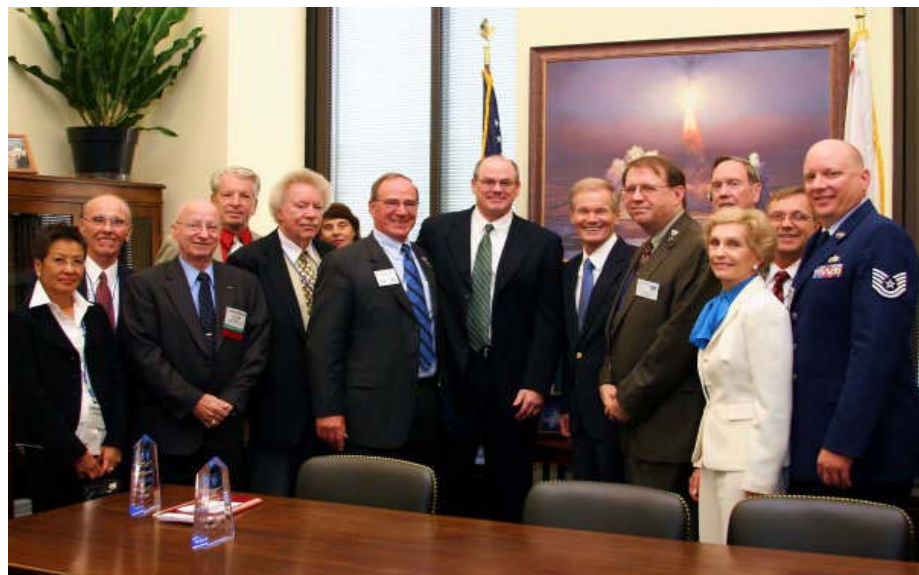
Florida delegates meeting with Senator Bill Nelson on Sept 25, 2007 to discuss issues of concern to Florida AFA members.