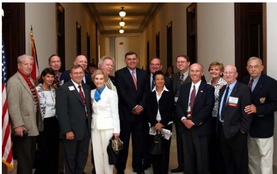
Florida delegates meeting with Senator Mel Martinez on Sept 25, 2007 to discuss issues of concern to Florida AFA members.