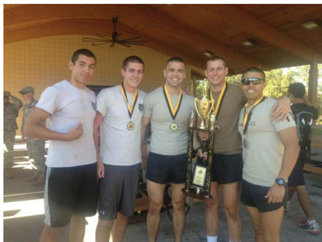
2013 UCF Iron Knight Winners

At the end of February, the cadets were "all-in" to support AFA's annual Air Warfare Symposium.