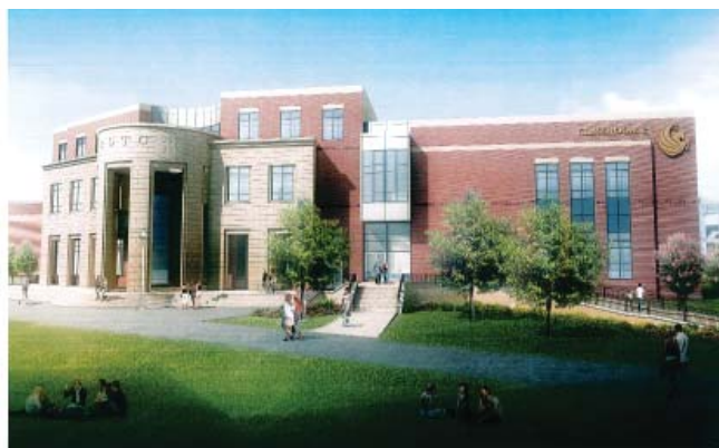
Grand opening for new ROTC building coming November 2013.

Thank you to the Central Florida Chapter of the AFA for your tremendous support of Detachment 159. We hope you will join us side-by-side as we dedicate the new building.