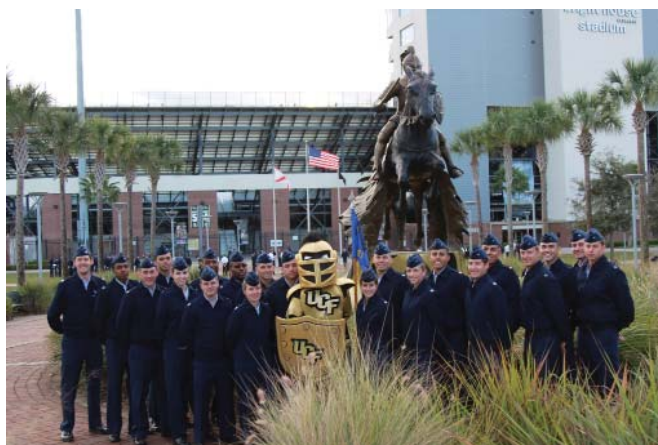
2013 AFROTC Graduating Class set for Commissioning on May 5th.

Graduation is just around the corner. Commissioning is set for 5 May 2013. Many of the seniors